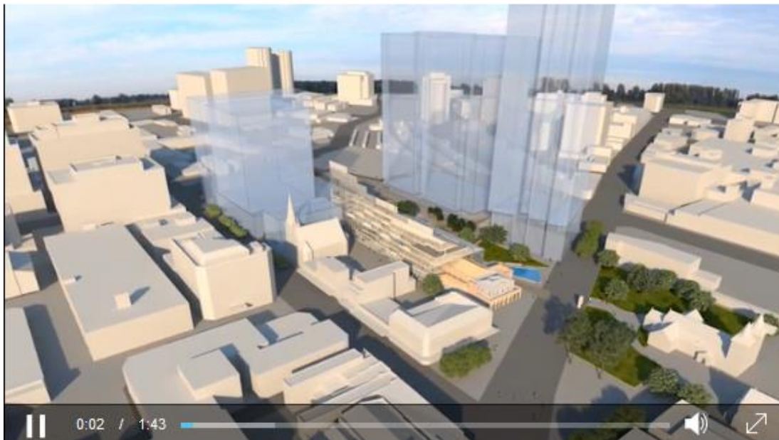
Winning design for Parramatta Square cultural centre

PARRAMATTA will fly into the future with a cutting-edge design for its new civic and community centre.