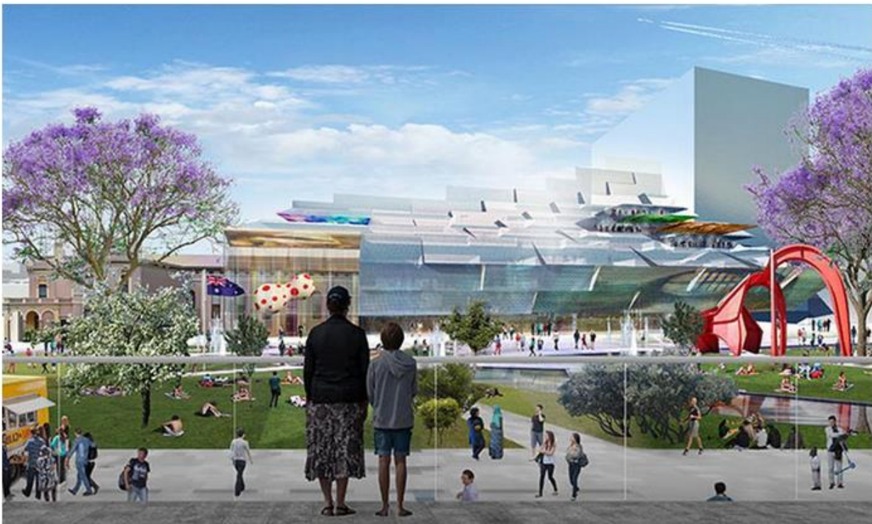
The glass exterior will include a large LED screen for public art projections, and cantilevered levels that will shelter public terraces and a rooftop garden Parramatta City Council