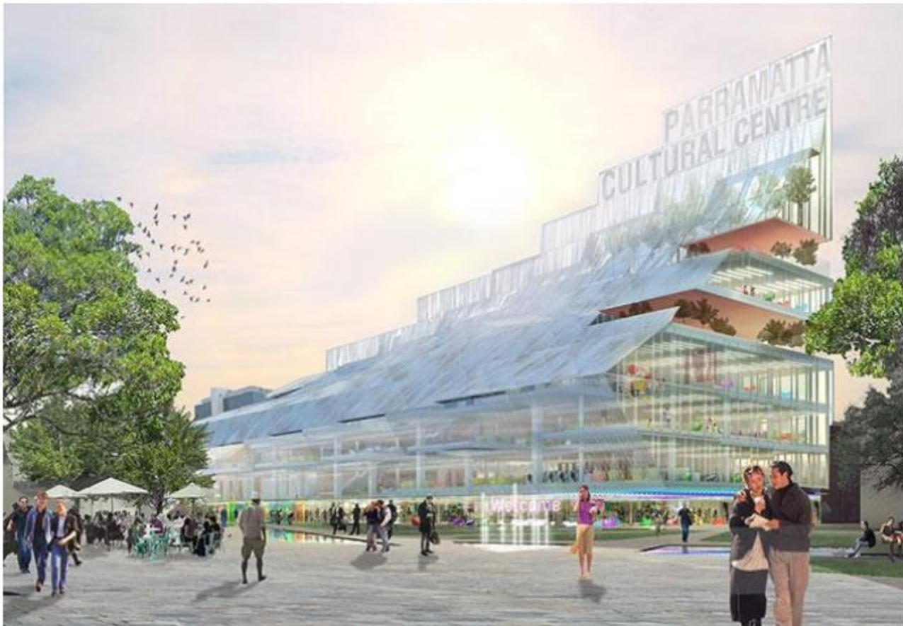
The semi-transparent building will be formed of a stack of crystalline layers arranged in a wave-like structure extending from the city's Town Hall Parramatta City Council

French studio Manuelle Gautrand Architecture and Australian firms DesignInc and Lacoste + Stevenson have been unanimously chosen by Parramatta City Council to design a six-storey cultural hub for the Australian metropolis.