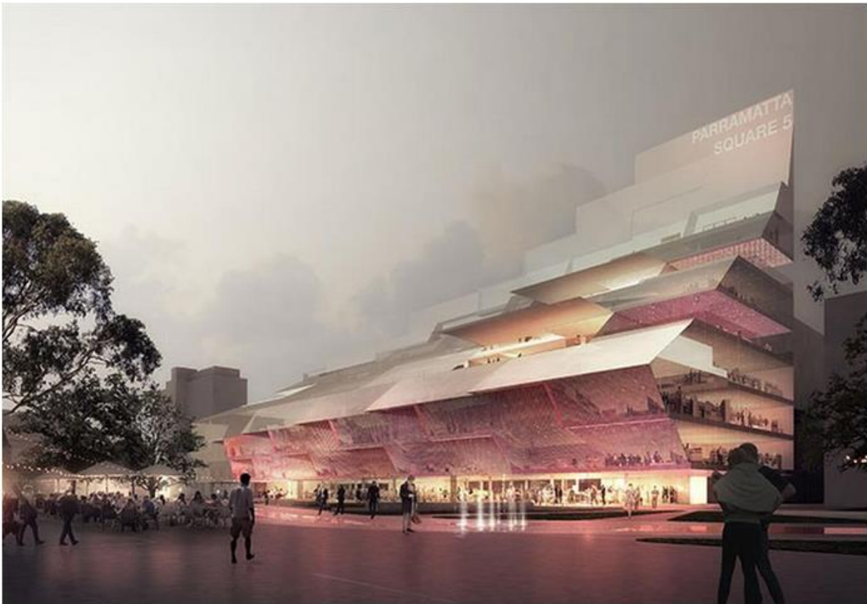
The AU$50m (US$39m, €34m, £27m) will have a floor area of 8,000sq m Parramatta City Council

5 Parramatta Square will form part of a larger city centre development which is adding extensive new areas of greenspace and public realm at a reported cost of AU$2bn (US$1.5bn, €1.4bn, £1.1bn).