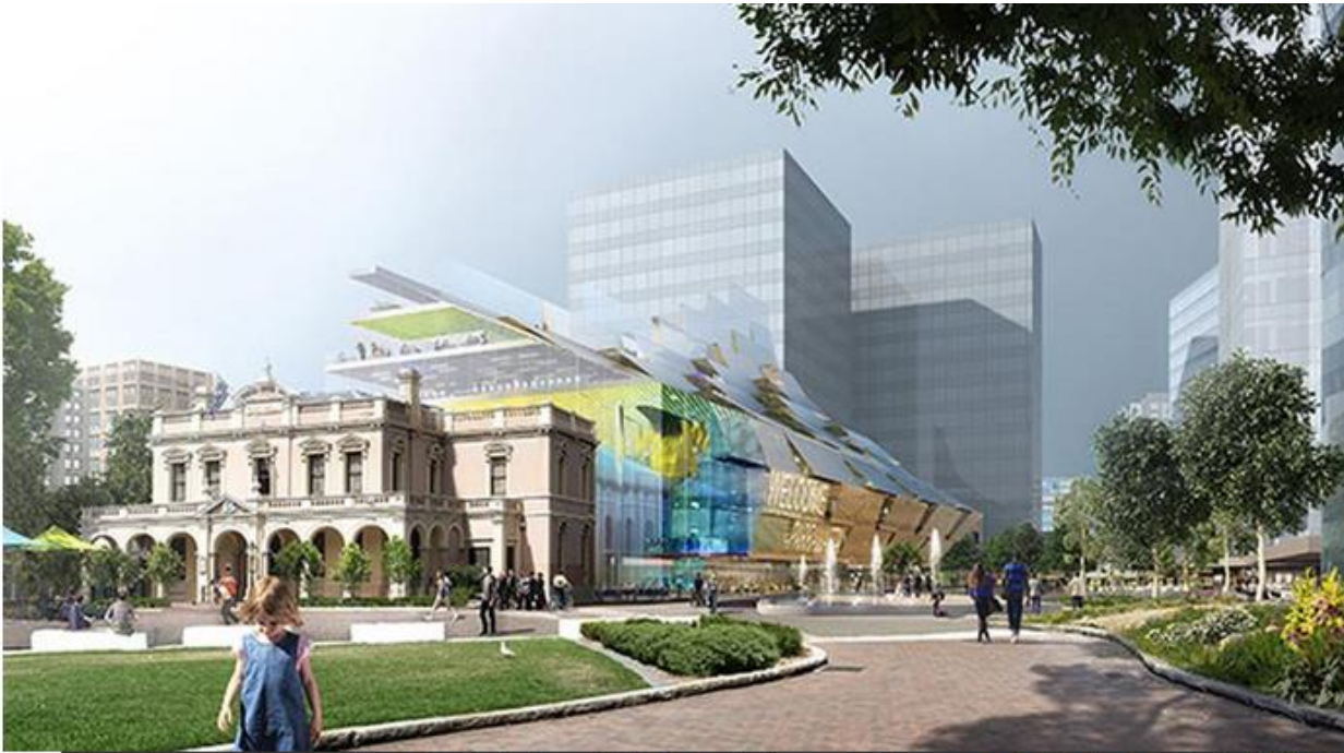
5 Parramatta Square will form part of a larger city centre development which is adding extensive new areas of greenspace and public realm at a reported cost of AU$2bn Parramatta City Council

Lien internet : http://www.cladglobal.com/CLADnews/architecture_design/Parramatta-civic-hub-5-Parramatta-Square-Manuelle-Gautrand-Architecture-DesignInc-Lacoste--Stevenson-/323550?source=news