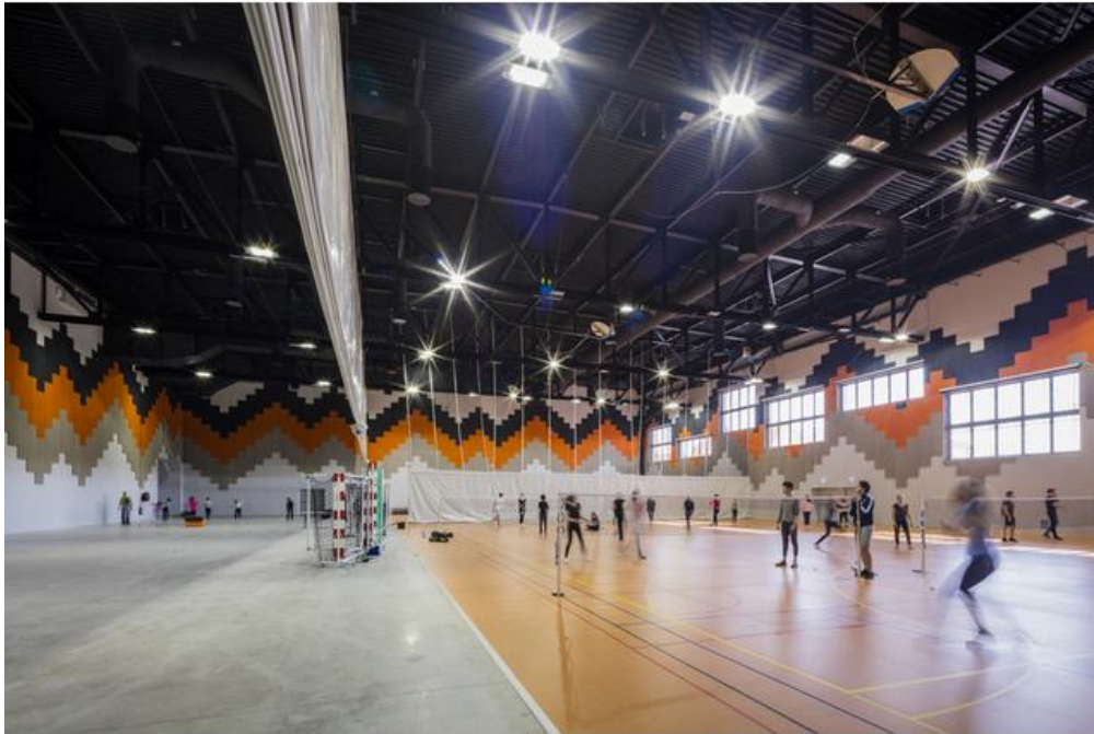
↑ Manuelle Gautrand Architecture, Le Forum, Great Hall, Saint-Louis, France.

The project is actually made of two envelopes with complementary functions: a first structural envelope constitutes the core and shell, guaranteeing thermal and acoustic insulations. It is made alternatively of reinforced concrete walls, or of a light metallic set. Over this envelope, a second skin is wrapped, made of large expanded metal panels, mounted on a very simple steel frame and relatively repetitive. Their mounting over the core and shell volume creates a wide plenum. This plenum, protected by the big uniting envelope that really embraces all the faces of the building, answers two technical issues. First of all, it masks the numerous and large-sized technical equipment that have been installed on the roofs. In second place, it provides thermal protection during summer, with protective shadows and natural ventilation, allowing to minimize the use of air conditioning.