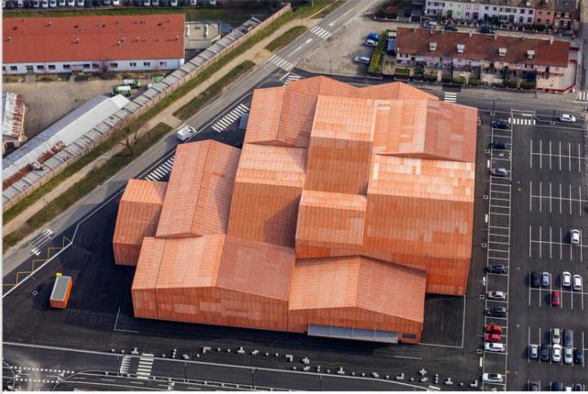
↑ Manuelle Gautrand Architecture, Le Forum sports, associative and events facility, Saint-Louis, France.

— The Forum designed by Manuelle Gautrand Architecture replaces an old “Palais des fêtes” and is located in Saint-Louis, in the “Three Borders” region and in the inner suburb of Basel. The structure is a cultural facility designed to host associative, sporting and cultural events.