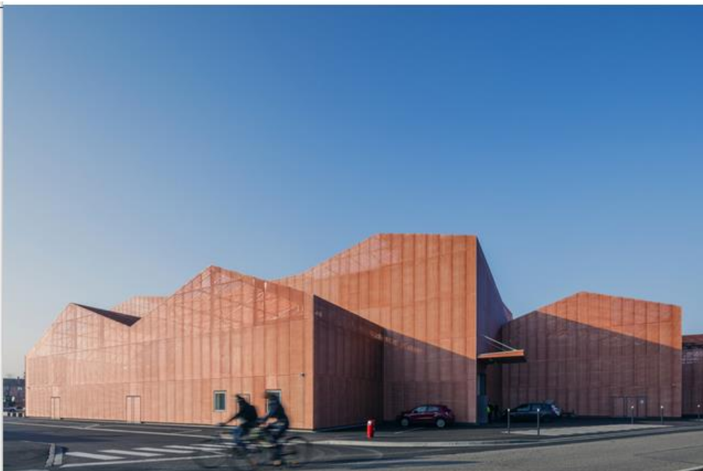
↑ Manuelle Gautrand Architecture, Le Forum sports, associative and events facility, Saint-Louis, France.

Thanks to its flexible design, the 1.870 sqm wide and 13 meters high Great Hall, hosts various functions: first it is dedicated to sport practice – namely basketball, handball, mini-handball, badminton, judo, and gymnastics – with a special eye to schoolchildren and sportive competitions. It also host concerts and shows, with a gauge of maximum 2400, together with exhibitions and fairs.