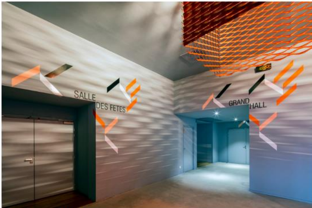
interior signage and wall texturing