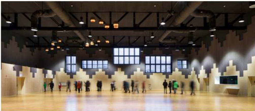
internal space image