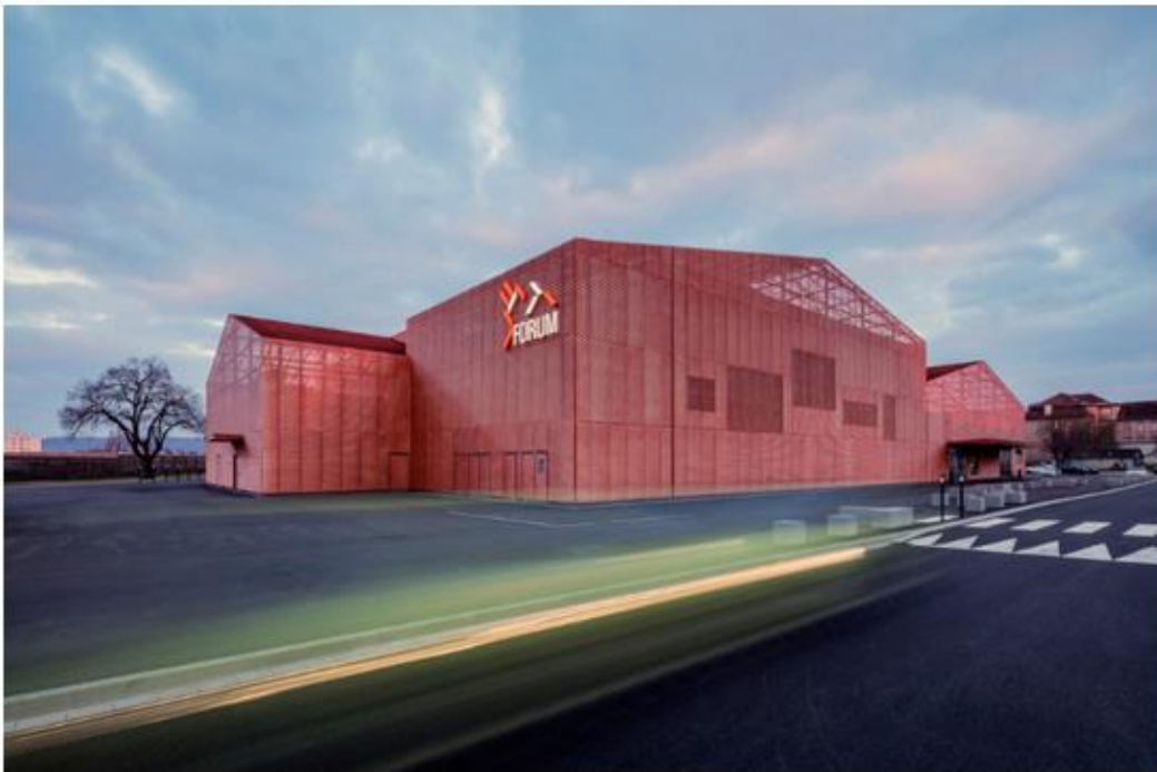
'forum' cultural center