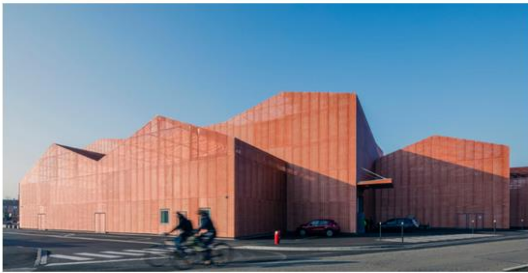
the translucent façade is composed of two distinct components