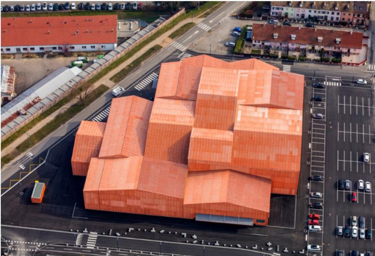
aerial view of the center

the great hall is a massive gymnasium like area that besides being able to accommodate sports events from badminton to basketball, can also host concerts for up to 2,400 people (standing) or about 1,000 seated. located in an area roughly 1,000m 2 smaller, is the festival hall. like its larger counter-part it functions as an easily adaptable volume. however, its proximity to a full commercial kitchen and 600 person banquet hall focuses uses dominantly towards culinary and catering.