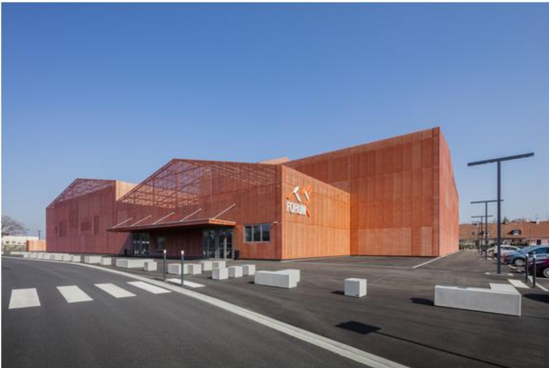
Click to see a larger image.

Parisian firm Manuelle Gautrand Architects told ArchDaily that the goal was to have a global theme for the complex. It's once you're through the doors that you realize the skin followed you inside, referencing itself in little riffs on the original pattern. Some of the metal skin carries through to the lobby area. The walls of the gymnasium quote the design and, as you can see from the pictures from the roof, any view outside is colored by the skin.