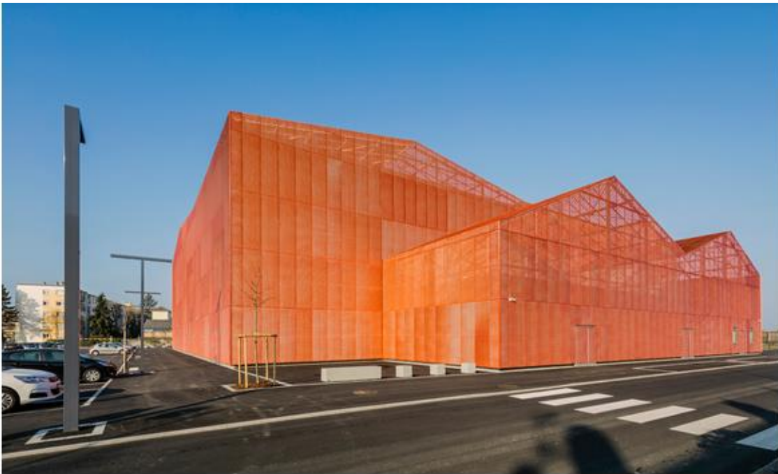
Click to see a larger image.