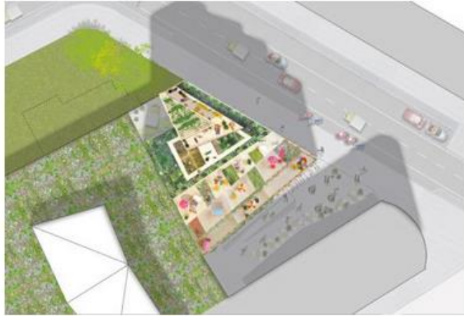
Level 05 Floor Plan