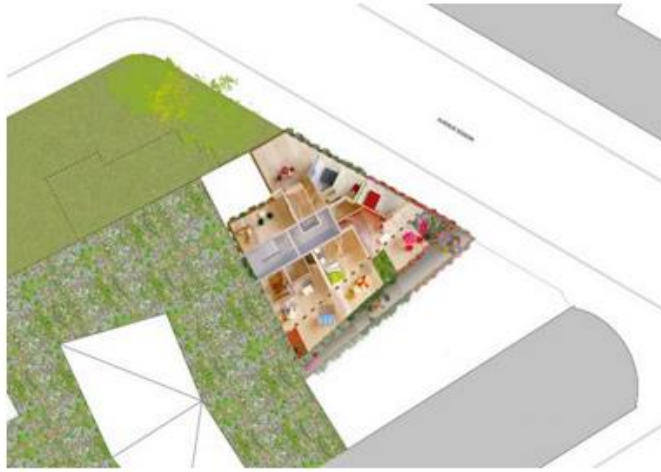
Level 04 Floor Plan