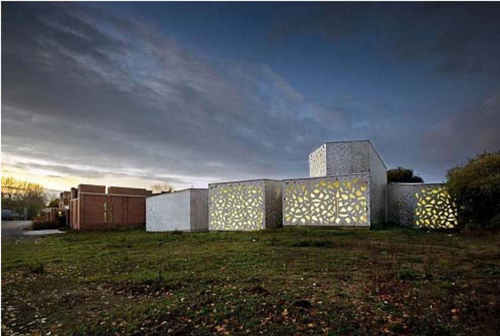
Lille Museum of Modern, Contemporary and Outsider Art