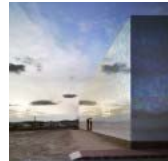
'MUCA' music and cultural centre by Cor & Partners in Algueña, Alicante, Spain