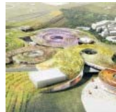
Europa City by Manuelle Gautrand Architecture in France