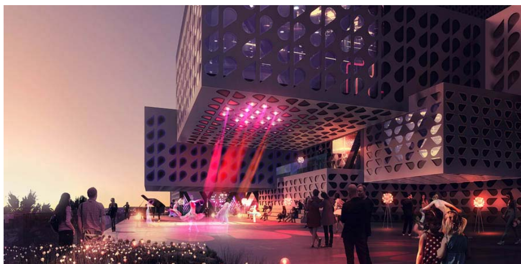
Music and Dance Centre by Manuelle Gautrand Architecture in Ashkelon, Israel.