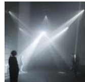
The flexible stages of 'La GAITE LYRIQUE' by Manuelle Gautrand in Paris, France