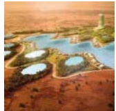
TENA TOWER – TENA RIVERS' mixed use development in Ouagadougou by Manuelle Gautrand Architecture