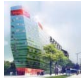
Enzo Hotel by Manuelle Gautrand Architecture in Paris, France