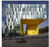
'La Cité des Affaires' Office Building by Manuelle Gautrand Architecture in Saint-Etienne, France