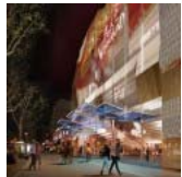
Alesia and Mistral Cinema Theatres by Manuelle Gautrand Architecture in Paris, France