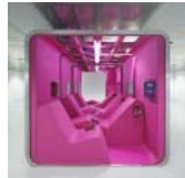
Mobility and flexibility of the public spaces of 'La GAITE LYRIQUE' by Manuelle Gautrand in Paris, France