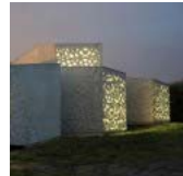
LaM – Lille Museum of Modern extension: reinvented landscape by Manuelle Gautrand Architects