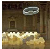
The restoration of 'La GAITE LYRIQUE' by Manuelle Gautrand in Paris, France