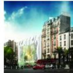
Exterior Facade.