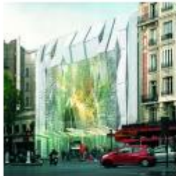
Facade Closeup. Image © KDSL

Photographs: KDSL, Manuelle Gautrand Architecture