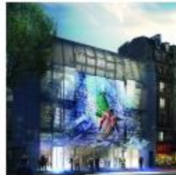
The Facade at Night.