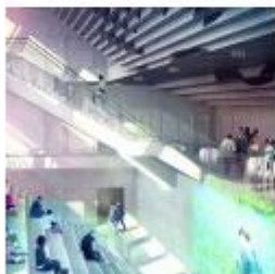
Seating Outside the Movie Theater Upper Floors of the Atrium.