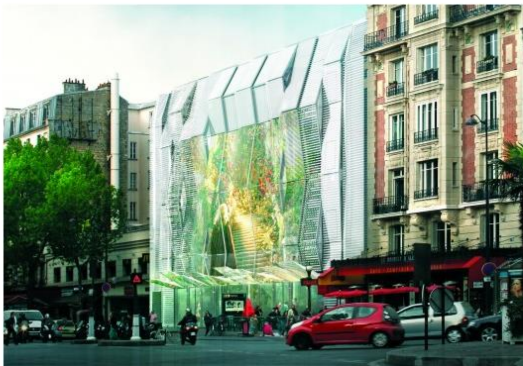
Facade Closeup.

Renovated numerous times during its history, Gaumont-Alésia, a Parisian cinema housed in a structure that is over 80 years old, will now be revamped by firm Manuelle Gautrand Architecture . With a design that emphasizes filmography's presence in modern culture, the Gaumont-Alésia is set to become an inviting cultural hub for the surrounding city, showcasing cinema's influence on both the interior and exterior.