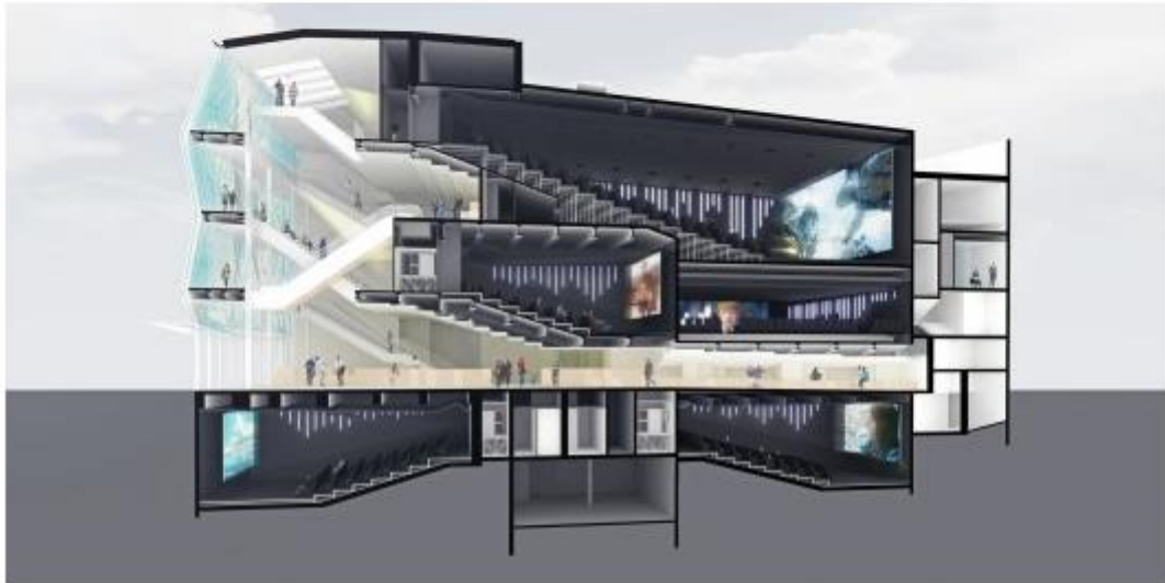
3D Section.

The building's main entrance is set at a busy intersection on Paris's General Leclerc Boulevard, and has an additional façade facing the street of Alésia. The three-story atrium into which visitors enter also declares the building's programmatic purpose, albeit in a less obvious way. The stepped ceilings that funnel visitors into the building's foyer mimic the seating of the theaters on the floors above. In addition, small theater-like seating located at the entrances to these theaters provide impromptu meeting places, as well as seating to enjoy movie previews and clips projected on the opposing walls. These spaces are set amidst a number of side stairways and escalators, emphasizing the building's aesthetic as a kind of vertical sculpture.